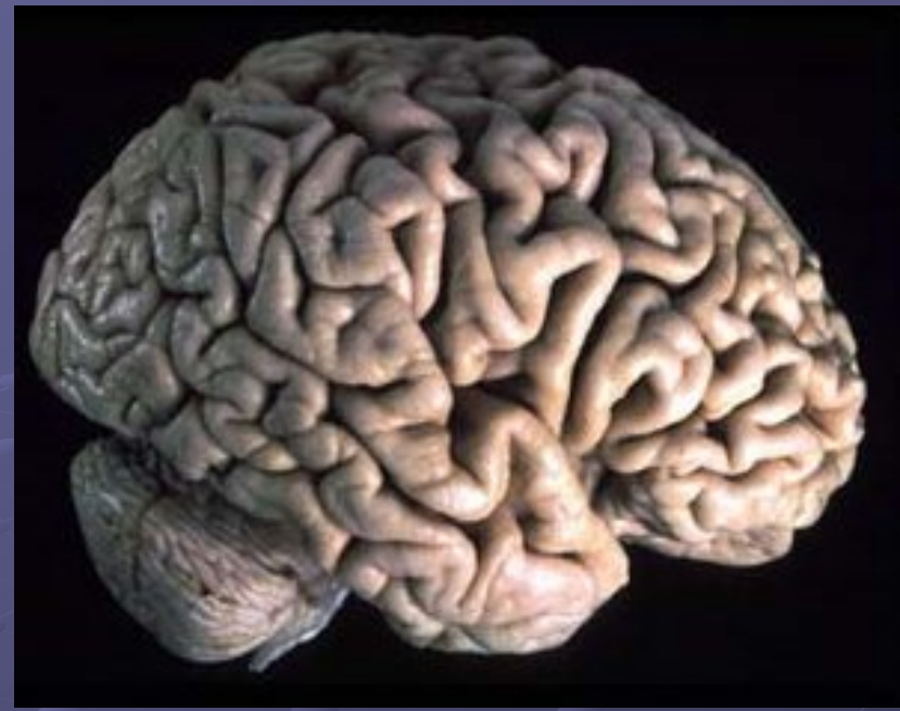
Time Magazine from the MEHRI Neuroscience lab